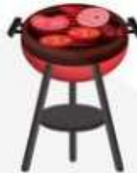
Bachelor griller (U.K.)